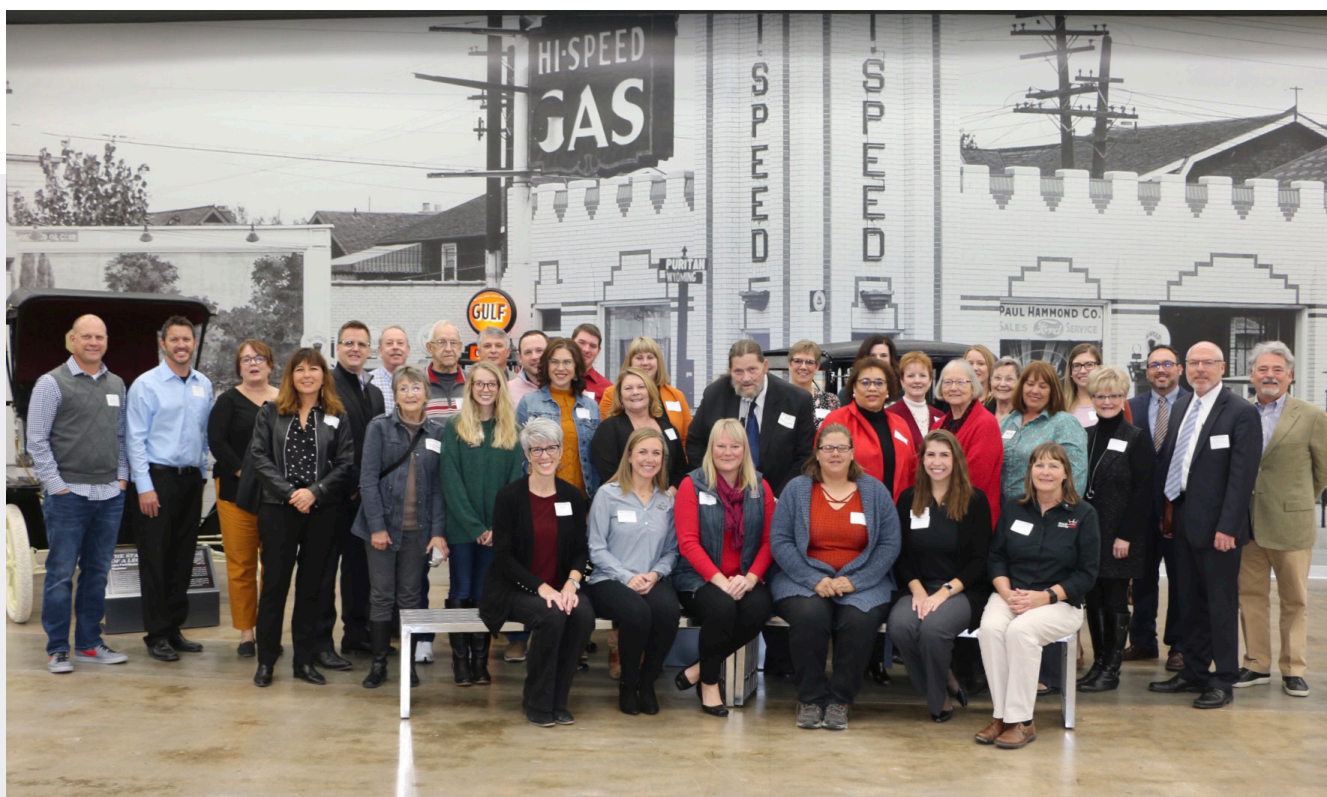
Representatives of 2019 Grant Recipient Organizations at the Semi-Annual Trustees Meeting and Grants Reception