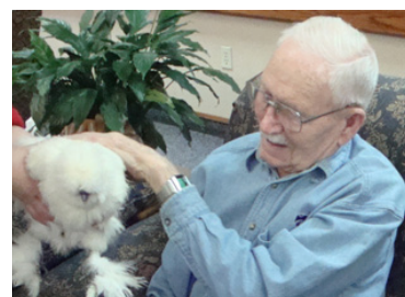
A resident of Stoneybrook Assisted Living admires Silky, a Silkie Bantam Chicken that is part of the Seniors Understanding Nature (SUN) Program developed by the Sunset Zoo. This program is fully funded through a grant from the unrestricted fund at GMCF.