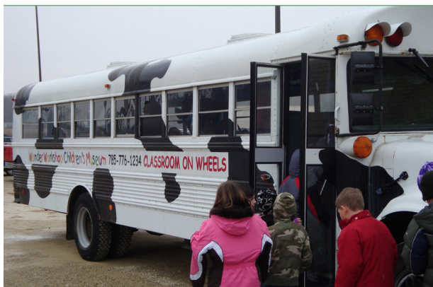
It's a cow, it's a bus, no, it's the Wonder Workshop! This Classroom On Wheels (C.O.W.) visits area schools featuring an exhibit about dinosaurs, geology, & paleontology. The Wonder Workshop received a grant from GMCF to have air conditioning & heating installed in the Bus.