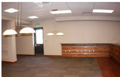
Game room in the new USO facility at Fort Riley which will soon be the home of a pool table provided by a grant from GMCF

Since before the United States entered World War II, the USO (United Service Organizations) has been the bridge between the American public and the U.S. military. A brand new USO facility is scheduled to open soon at Fort Riley and will be a "home away from home" for service members and their families. The center offers game rooms, movie theater, computer lab, fireplace lounges, meeting room, family room, café with free snacks and drinks and a library.